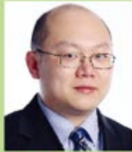
Ye Zhen International expert on creative industry of UNIDO