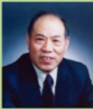
NIU Wenyuan Counselor of China's State Council, member of the CPPCC National Committee