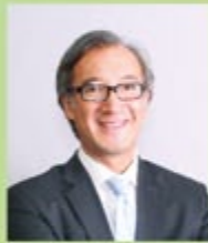
Jean-Jacques Soulacroup Chief Representative of the European Investment Bank in China